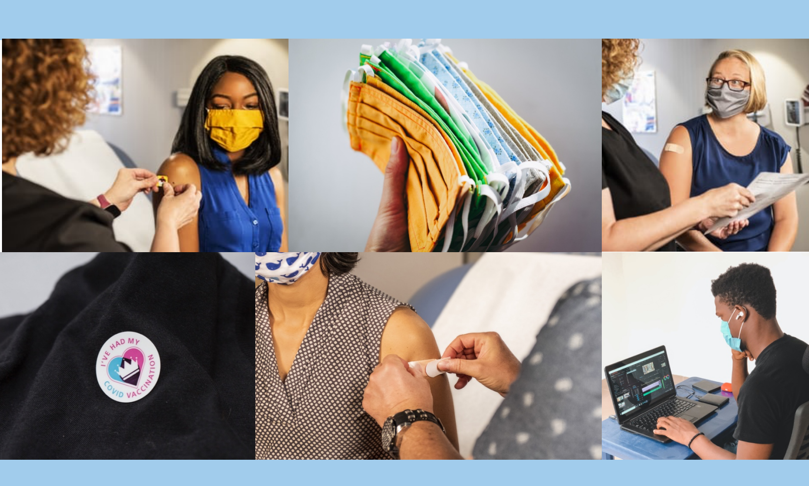
University of Iowa Prevention Research Center for Rural Health 2022