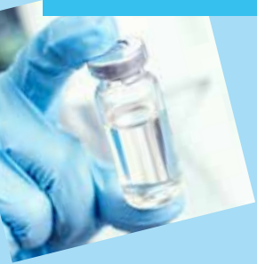
Number of Antigens in Routinely Recommended Childhood Vaccines over Time

Antigens are the parts of viruses & bacteria that induce immune responses. By introducing antigens in a vaccine, we can protect people if they are exposed to the virus or bacteria in the future.